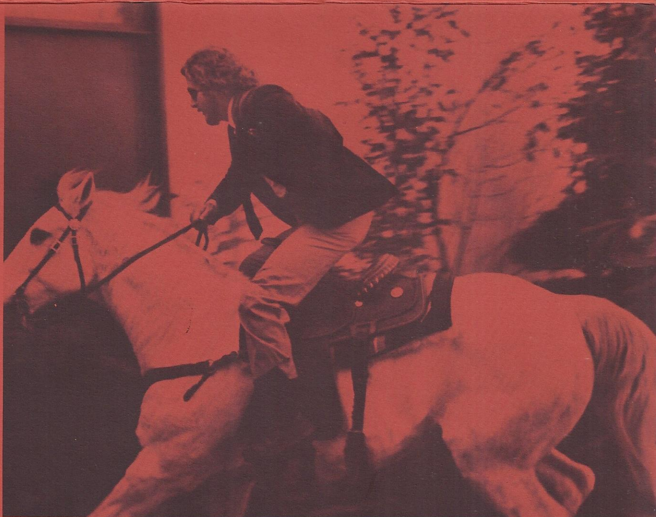
John Heard in/dans "Cutter's Way"