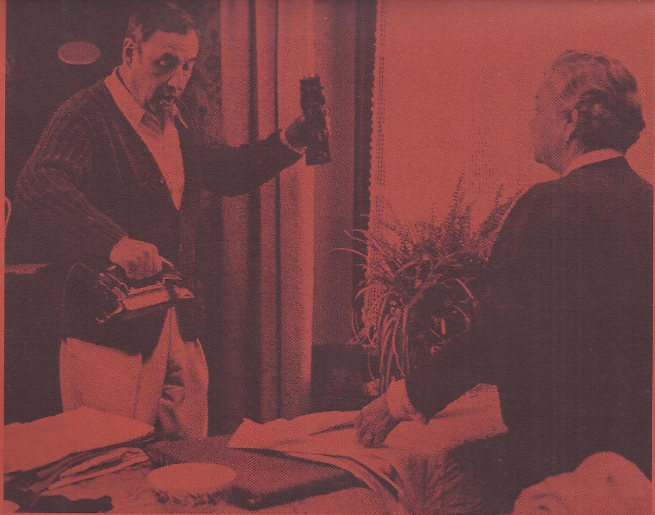
Philippe Noiret & Simone Signoret dans/in "L'étoile du Nord"